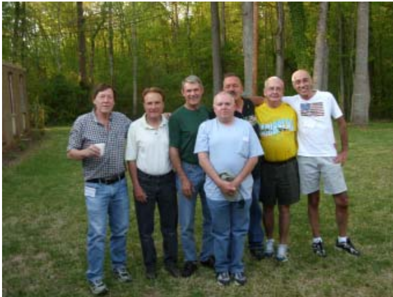
Your 2010 Board of Directors