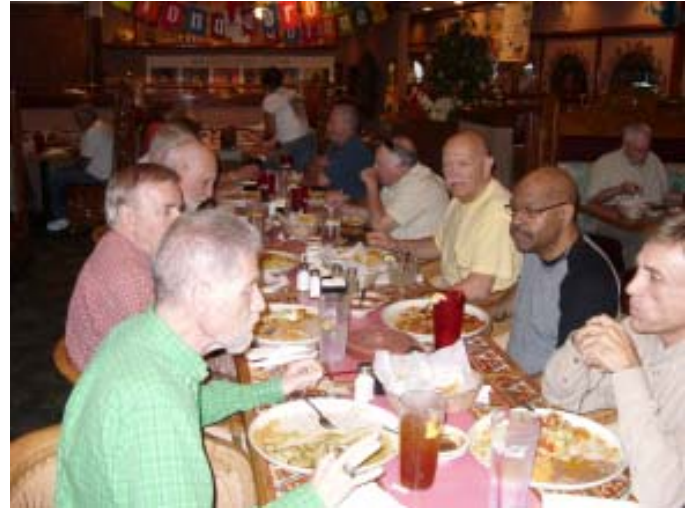
Dinner at Azteca Mexican Restaurant