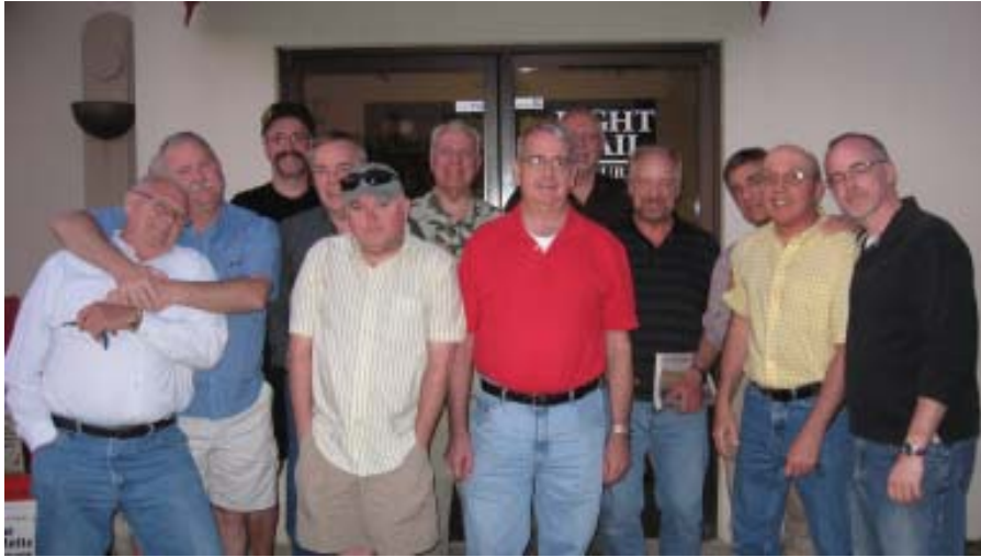
Dinner at Light Rail Restaurant