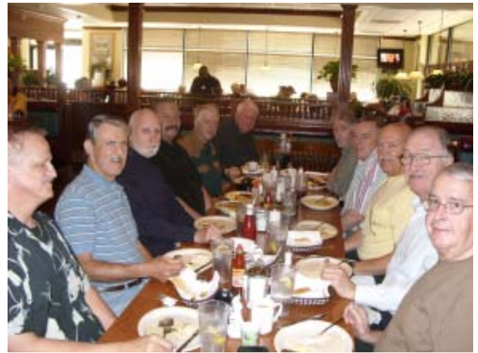
FABS at Tryon House Restaurant